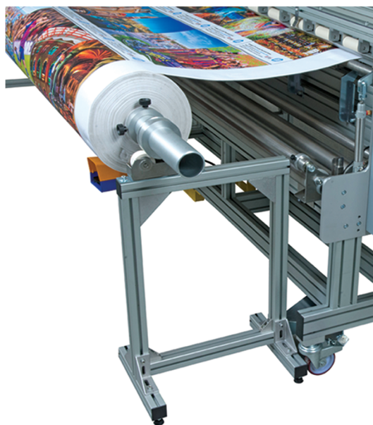
Heavy Duty Roll Feeder

The XL Series can handle media with a maximum thickness of 40 mil including polycarbonate, laminates and encapsulated media, photo paper, vinyl, self-adhesive vinyl, graphic arts film, duratrans, canvas and much more.