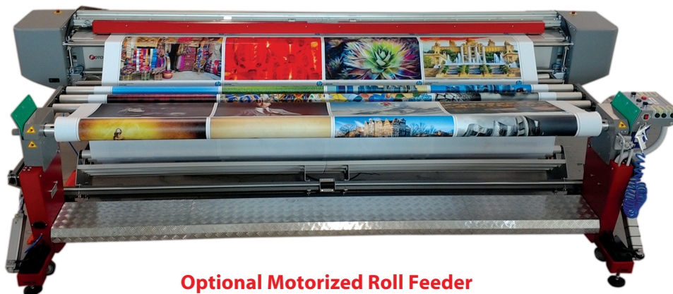
Optional Motorized Roll Feeder Can easily hold 660 lbs.

Spindle is compatible with HP Models LX 1500/3000/3100/3500